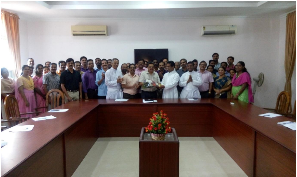
Professional ethic programme for administrative staff on 12/06/2017